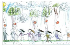
A Beautiful Day at Woodend!

A very special thank-you to the students from Lincoln Centennial School for sharing their stories and drawings about their day at Woodend! The Living Campus will expand opportunities for students to enjoy outdoor education and to engage in hands-on learning.